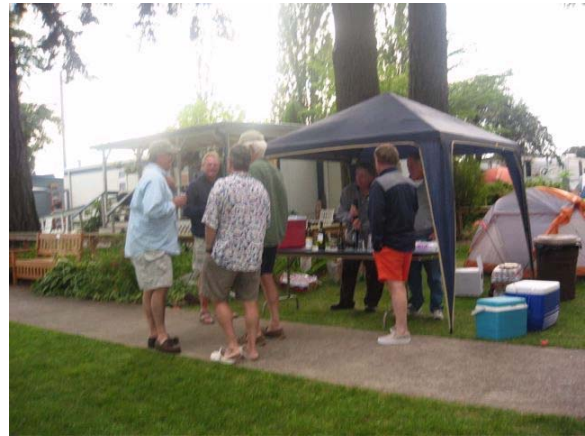
Mmmmmm – Beer (and wine too!)