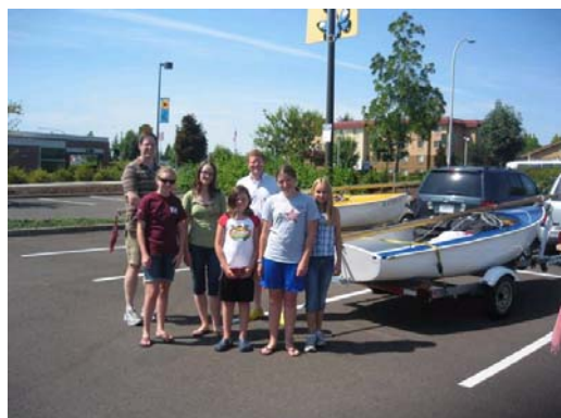
Fleet 80 Seattle On the Road