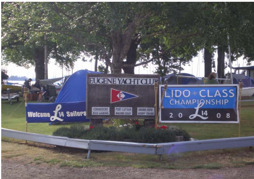
Scenes from Eugene YC