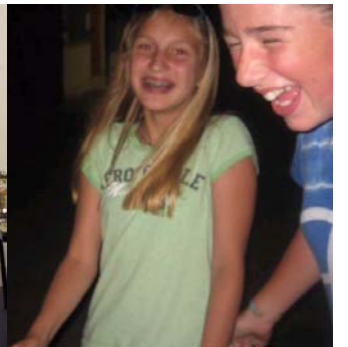
Faces In the Crowd at Fern Ridge