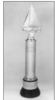
Midwinter Snipe Class Snipe

Don't Be Disappointed - Order Your T-Shirt Today!