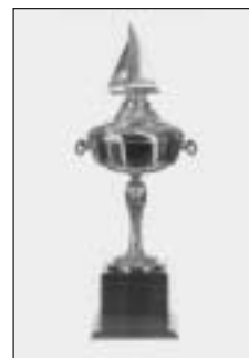
Frank Dair Trophy PHRF B