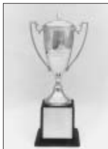
Harry Wills Trophy PHRF C

1st Warning signal 11:55 a.m. Saturday and 8:55 a.m. Sunday