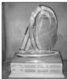
SBYRC Sport Boat Sport Boat