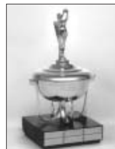
Jr. Naples Sabot Trophy Jr. Naples Sabot A