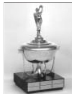
Jr. Naples Sabot Trophy

Hospitality: The Wind Wizards will be hosting a barbeque and potluck Saturday evening on the lake. Bring your instruments and join in on a magical evening around the campfire. Sunday morning will start with a club breakfast at 8:00 a.m. Wives, husbands and guests of race participants are invited to take advantage of the Club's hospitality for all of the weekend's activities. The racing activities can be clearly viewed from the camp. Come and enjoy the Midwinters on dry land.