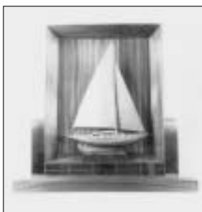
Kenneth E. Street Memorial PHRF A