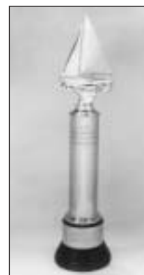
Midwinter Snipe Class Snipe